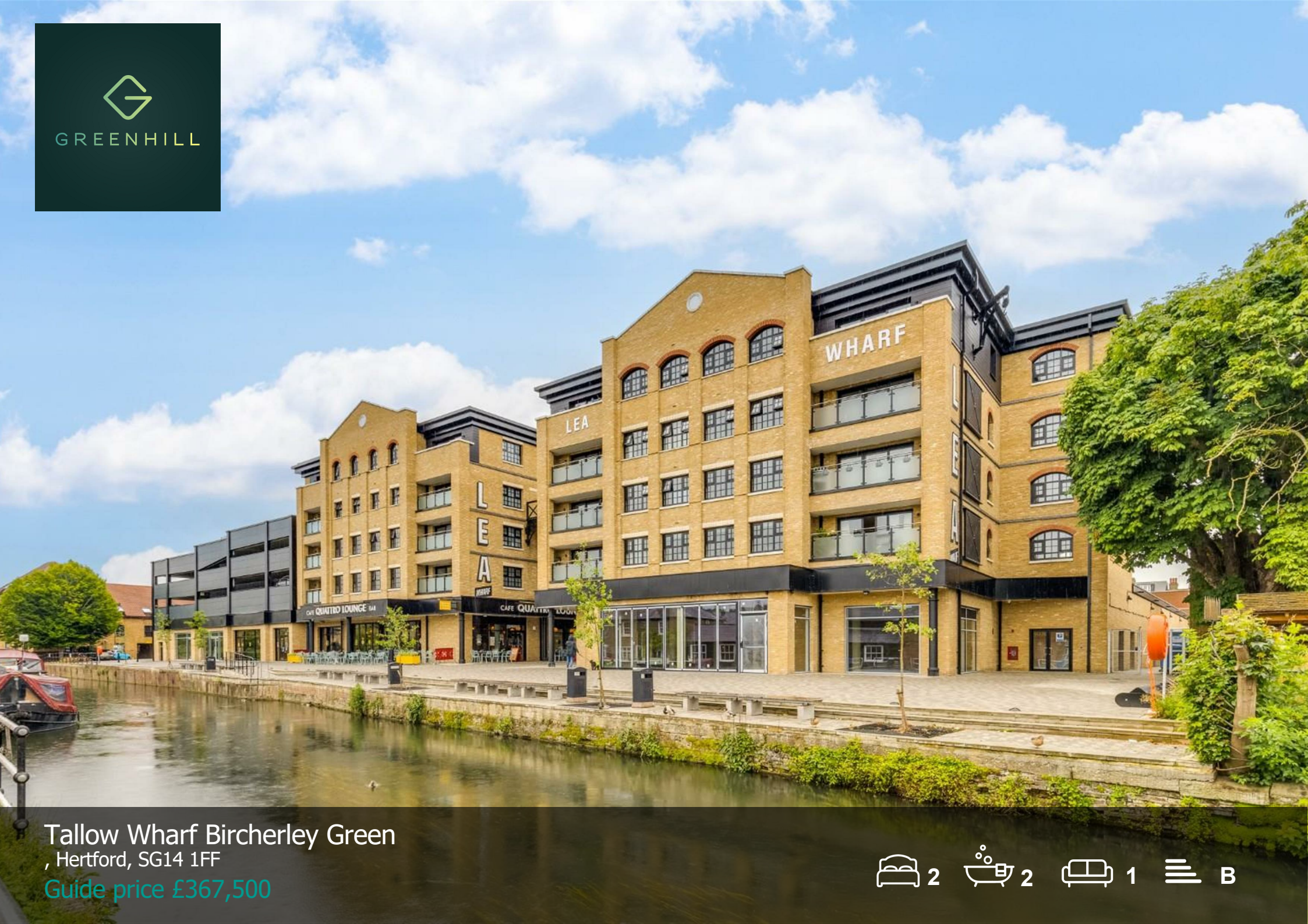
Tallow Wharf Bircherley Green , Hertford, SG14 1FF